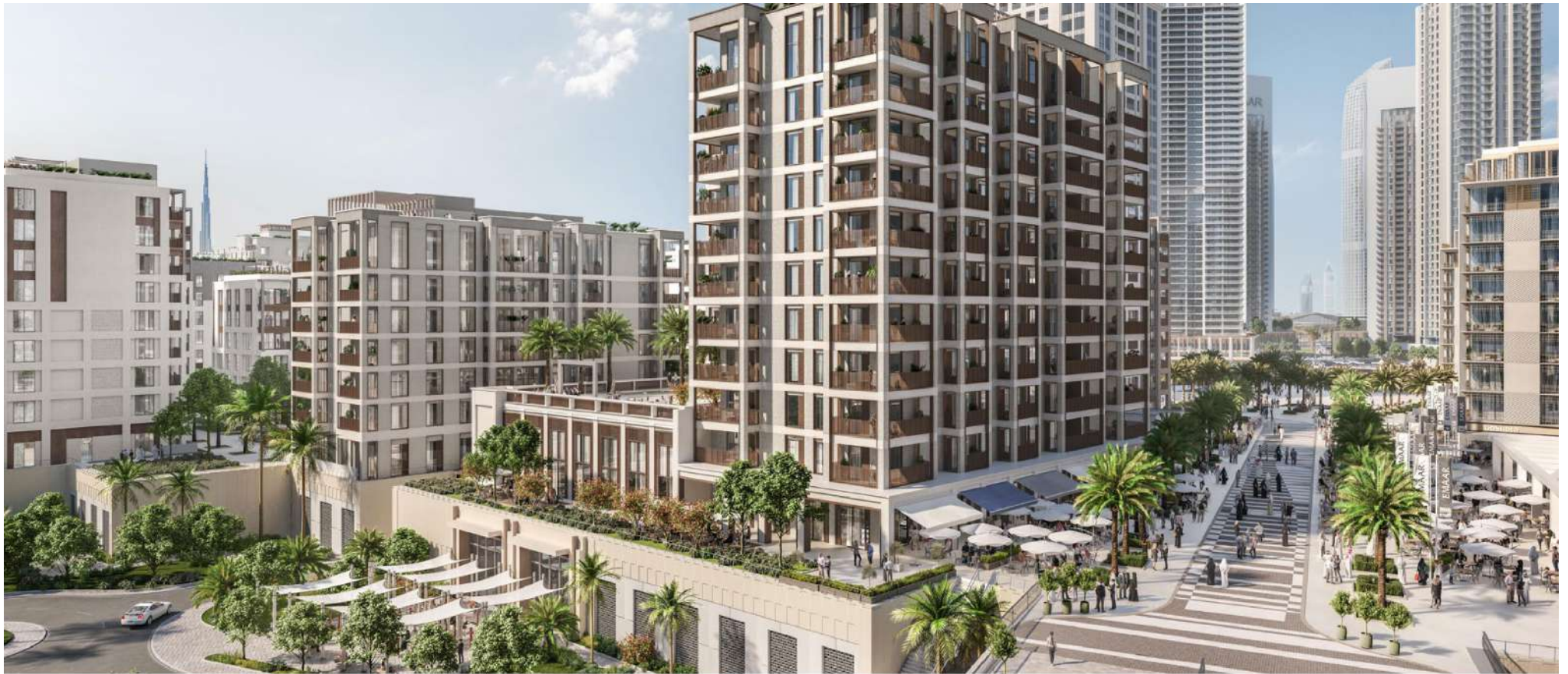
A Contemporary Old Town with a Touch of Heritage