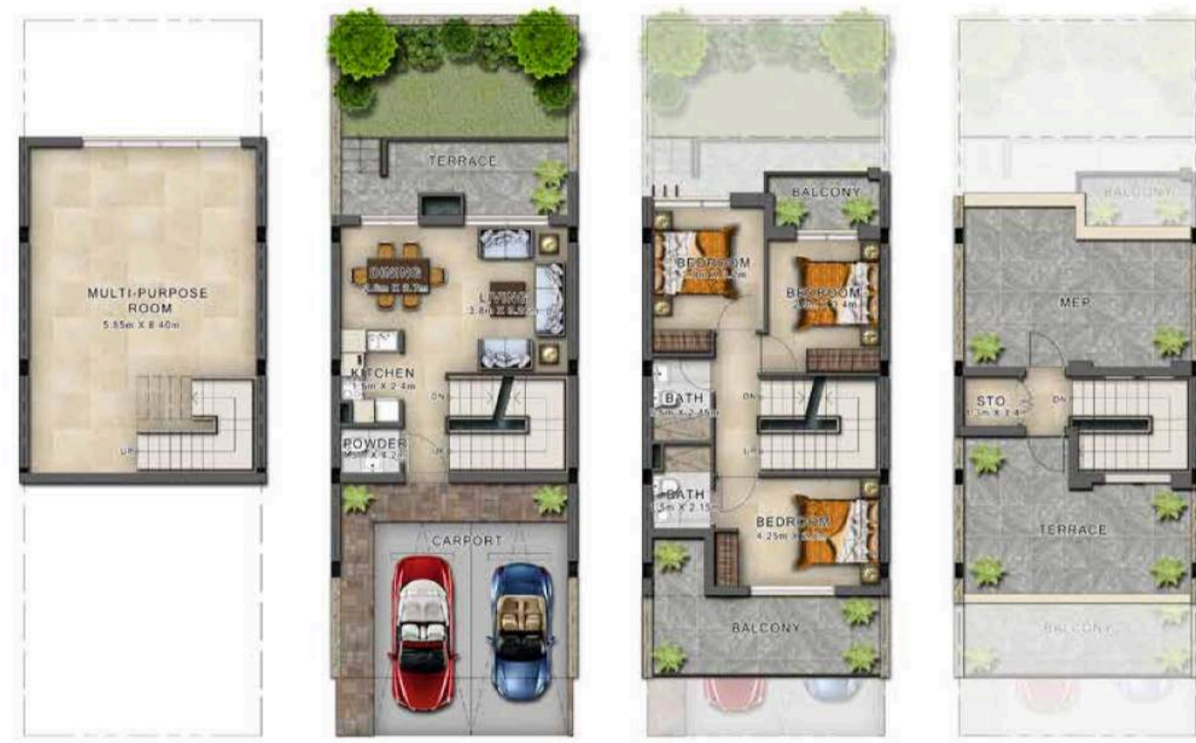
LOWER GROUND GROUND FLOOR FIRST FLOOR TERRACE