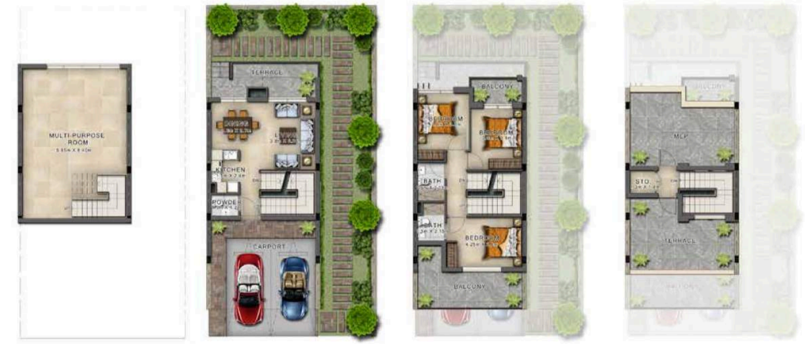
LOWER GROUND GROUND FLOOR FIRST FLOOR TERRACE